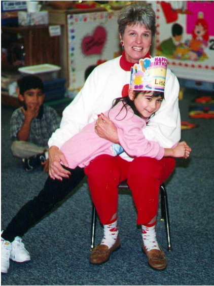
I am at Kindergarten and my teacher is pretending to spank me (for my 6 TH birthday).