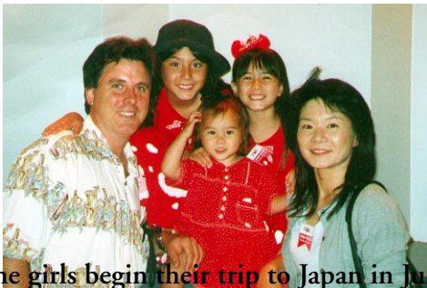
The girls begin their trip to Japan in June

Speaking of which, we purchased a number of mountain top acres north of the city of Santa Cruz. Once we traverse the bureaucratic maze that is the building department in that county, we'll begin construction. With a little luck, by next year at this time we'll have moved in.