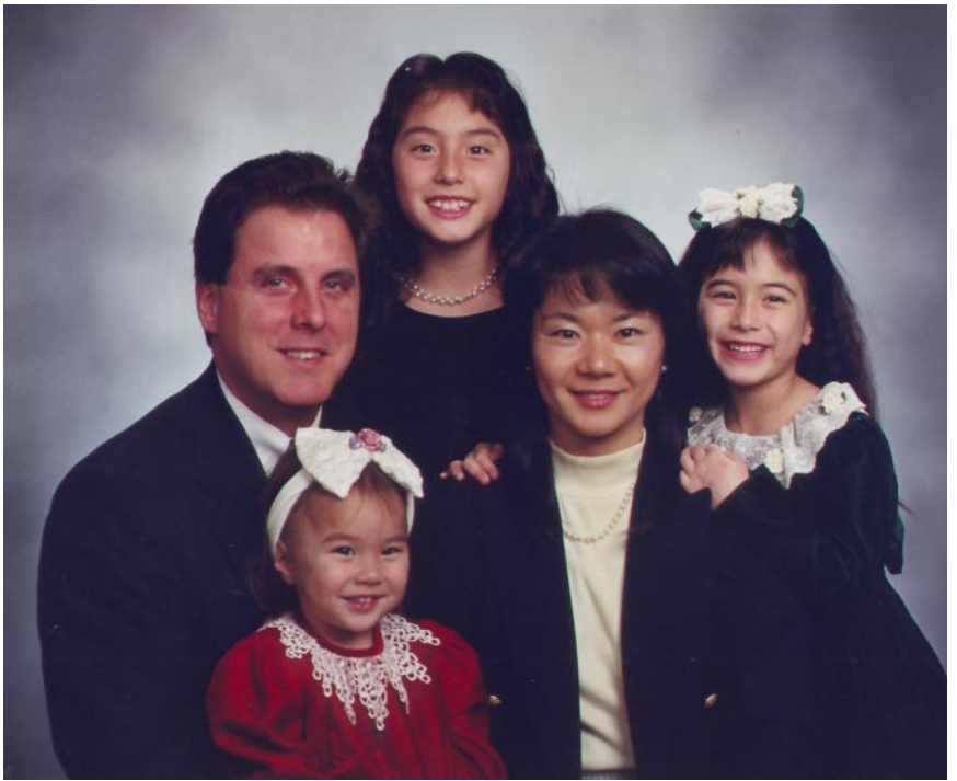
Our Family Portrait 2000