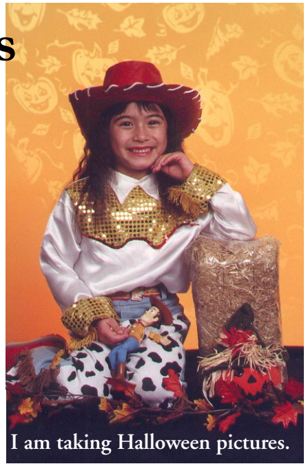
I am taking Halloween pictures.